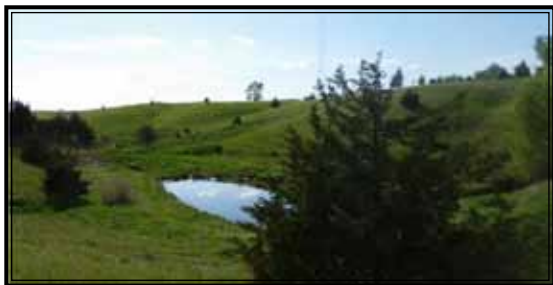
Figure 2. Good Earth State Park northern grasslands and small pond