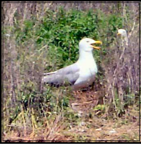
Adult Herring Gull at Nest, Hughes County.

I experienced some apprehensive excitement on this outing, as five unexpected adult Herring Gulls were also present on the large island. This inspired me to look diligently for evidence of a Herring Gull nesting. After about an hour of circling the island in the boat, to my glee, I finally spotted a sixth Herring Gull sitting on a nest.