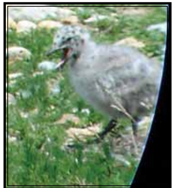
Herring Gull chick digiscoped from a rocking boat!